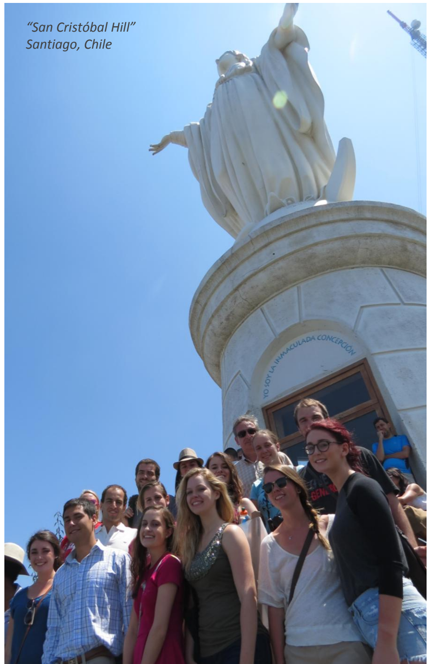
"San Cristóbal Hill" Santiago, Chile

Short-term Program at Universidad de los Andes