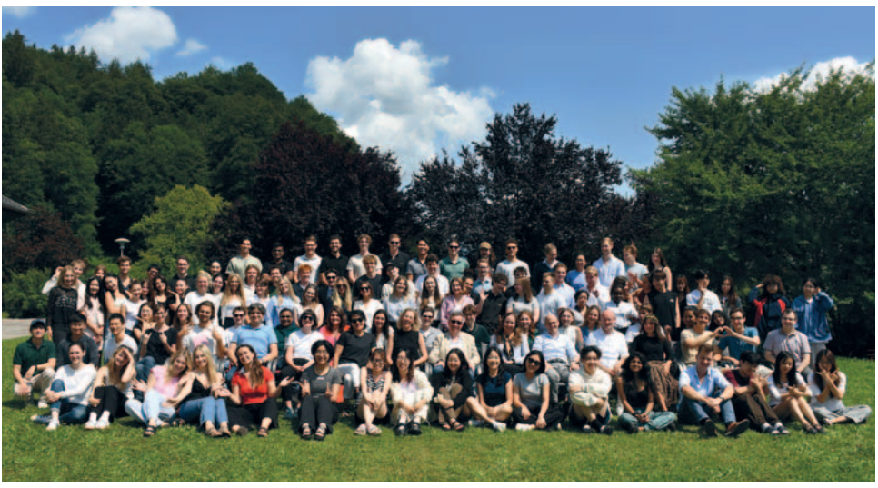
Summer school participants 2024